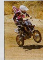
Nice wings, kid.