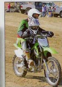
Even the really young bucks got a shot at riding.