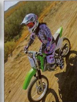
The trails at Rynoland were epic as always.