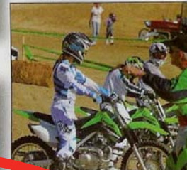
Kawasaki assembled a crack squad of instructors to teach some private riding lessons.